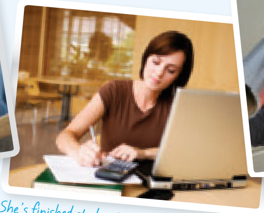
She's finished study at 21yrs and is on a low income