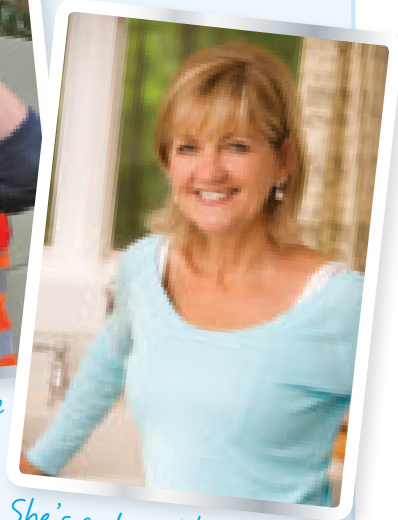
She's a stay at home mum