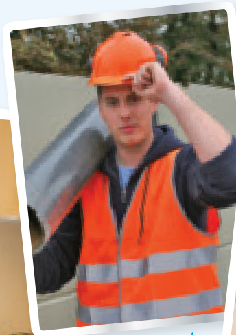
He's an apprentice