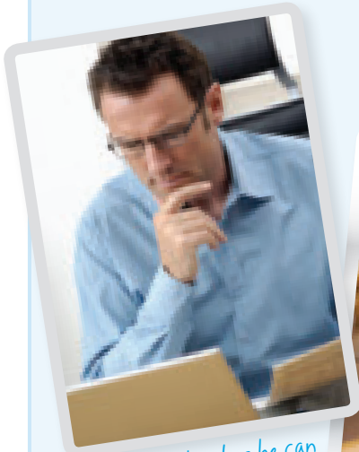
Dad works as hard as he can